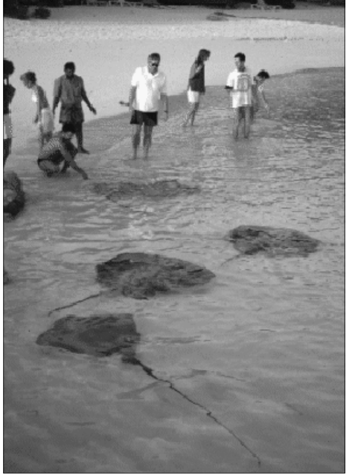
Feeding wild stingrays is a tourist attraction on some islands.

The Republic of Maldives is a country composed entirely of coral atolls. Located in the central Indian Ocean, its two major economic activities in the Maldives are fishing and tourism. Fishing has