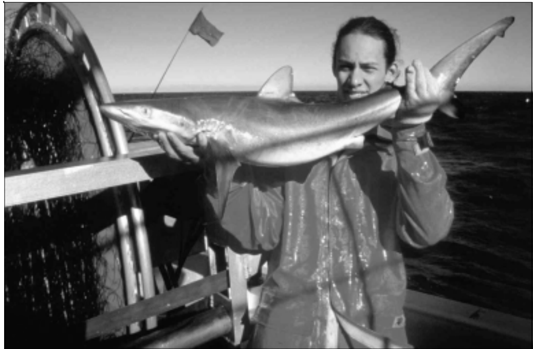
New-born dusky shark.

The results of this assessment are interesting in that they indicate a possible strategy for commercially exploiting long-lived, late maturing, slow growing, low reproductive rate species. This strategy is to target fishing at the youngest age class. In the case of the Western Australian dusky shark population, only one in six individuals survive to maturity (due to the late age at maturity) so most of the neonates caught would have died anyway.