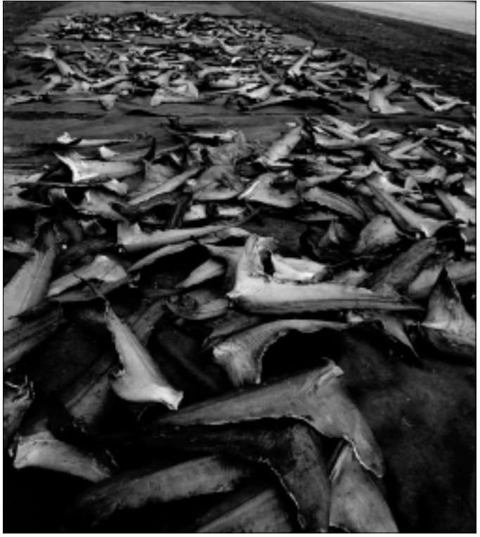
Fins drying at Cape Town docks, South Africa.

Recognizing that cooperation among fishing nations is key to achieving effective management of migratory fish stocks, the United States has been a leading proponent of international shark conservation initiatives. In a statement released at the bill's signing, President Clinton reinforced US commitment to the