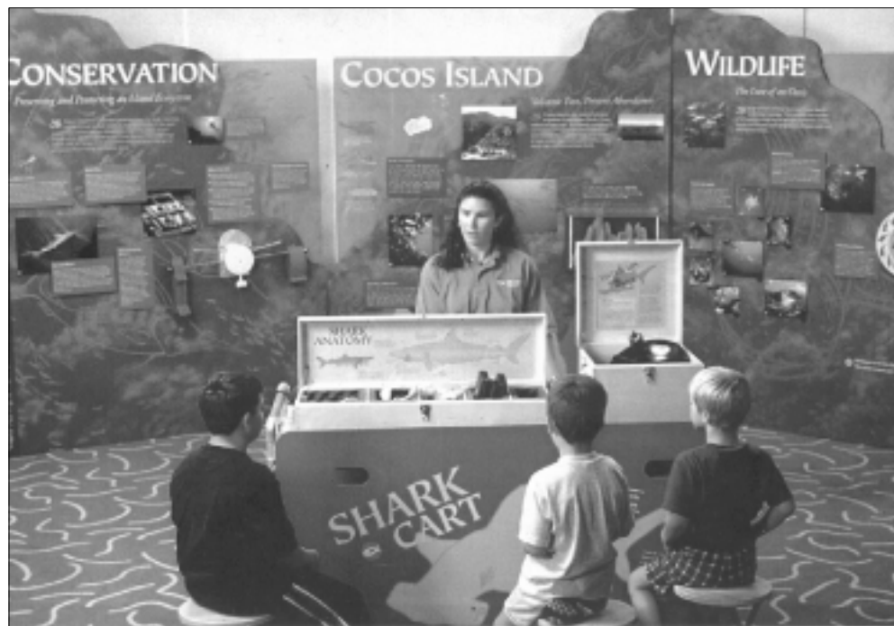
New England Aquarium "Shark Cart".

Public aquaria, since their inception in the mid-1800s, have always had an element of learning. The primary aims of these first aquaria were both recreational and educational, providing visitors with basic information in areas such as natural history and species identification. Aquaria today have shifted their focus from recreation with education, to education, research and conservation, sprinkled with entertainment.