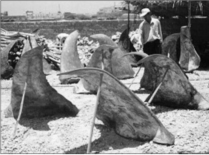
Whale shark fins drying in Indonesia.

70% of the world's fisheries were at an unsustainable level. Wasteful killing of ocean wildlife, through bycatch, amounted to over 1.2 million tons of turtles, birds, marine mammals and non-targeted fish, including sharks, each year in the USA alone. One of the messages aquaria must advocate is that sustainable fishery plans must include sharks. With the emerging wealth in Mainland China, the demand for traditional Chinese medicine and shark fin soup has increased dramatically. Cultural sensitivity is greatly needed in this area, as shark fin soup has been a highly prized traditional Chinese dish served to honour important guests for over 2000 years. The practice of "shark finning" has devastated shark populations worldwide. It is estimated that about one million tons of sharks and rays are killed every year. It is likely that this figure is an underestimate, as very few countries are keeping track of their shark fisheries or sharks as a bycatch of their finfish fisheries.