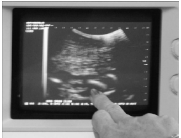
An ultrasound scan of embryos in a pregnant Triakis megalopterus held at Bayworld.

Some institutions are particularly well placed to link research and education. For example, the Port Elizabeth Museum at Bayworld has a large static display with sharks and rays. SCUBA divers, with appropriate qualifications, may enter the main tank of a linked aquarium to experience sharks first-hand, following an educational lecture. Aquarists and scientists undertaking shark research at such institutions are well-placed to assist with the displays and facilitate the broader education of the public. Such contributions can only support the conservation of sharks and rays. Both research and education have important contributions to make toward the long-term conservation of sharks and rays and thus aquaria have a fundamental role in this important goal.