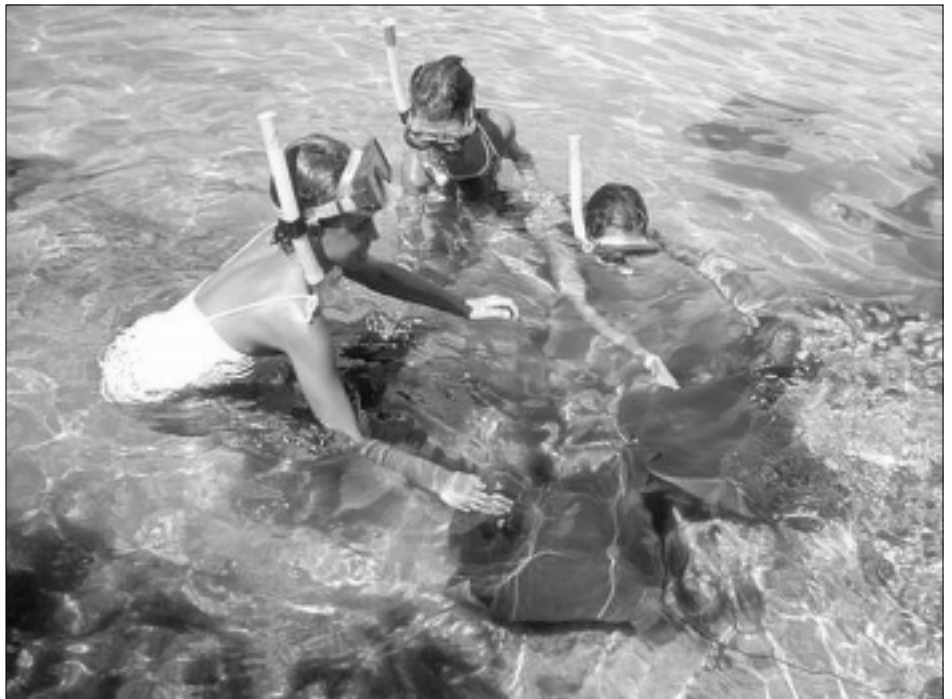
Swimming with rays, Monterey Bay Aquarium.

The messages aquaria have been promoting evolved alongside our continuing care for the animals and our approach to conservation. The messages we tell in the future will be built on those we tell today. How the messages are conveyed is limited only by one's imagination!