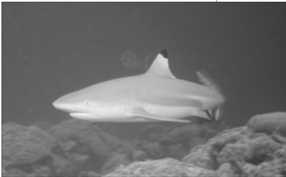
Blacktip reef shark, Carcharhinus melanopterus , Chagos Archipelago.

The Chagos Archipelago (or British Indian Ocean Territory) is a group of coral reefs, including five true atolls and a number of submerged atolls and platform structures. The Great Chagos Bank, a submerged atoll, is the largest atoll structure in the world, with a surface area of 13,000 km 2 . The total area of shallow reefs is 3,770 km 2 or 1.3% of the global total (Spalding et al. 2001). There are some 50 reef-associated islands or coral keys. With one exception, these have been uninhabited since 1971. There is a large US military installation on the largest island and southernmost atoll of Diego Garcia (Sheppard and Seaward 1999).