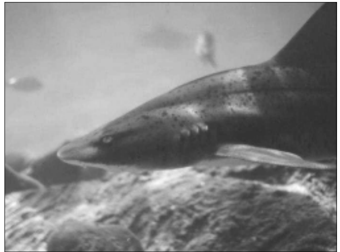
The endemic Southern African gully shark, Triakis megalopterus , adapts well to aquaria.

range and out of water. This means the animal usually needs to be caught and removed from the tank for 'reading', which can be a problem for large sharks that may be damaged in so doing. (Note: waterproof PIT tag transponders, with 'readers' attached via long cables, are now available. They can be incorporated into feeding poles so readings can be taken during daily husbandry routines.)