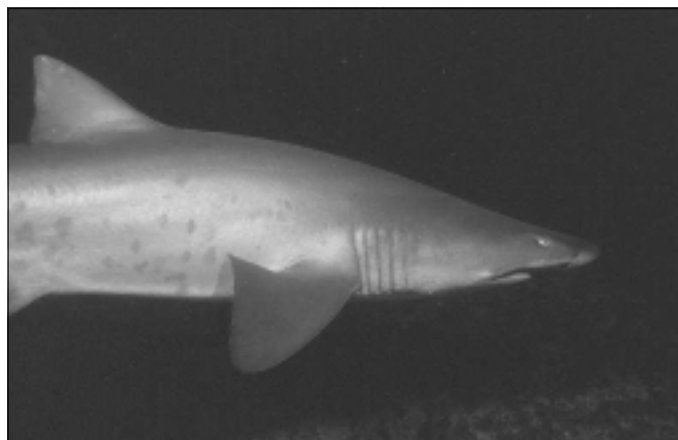
The ragged tooth shark, Carcharias taurus , is a popular shark for aquarium displays. It is hardy, large, and popular with the public.

Sharks, rays and other animals on public display cannot be in poor condition, or bear spaghetti tags or external markers for experimentation purposes. In general, visitors dislike seeing animals in anything other than unblemished condition. Fortunately, individual marking is possible in less intrusive ways. Some sharks have natural and unique markings or body patterns facilitating identification by researchers. A technological solution for those more difficult to distinguish is to use PIT (passive internal transponder) tags. These inert tags are injected and the unique coded number obtained from a reader passed over the animal. A present disadvantage is that the tags need to be read at close