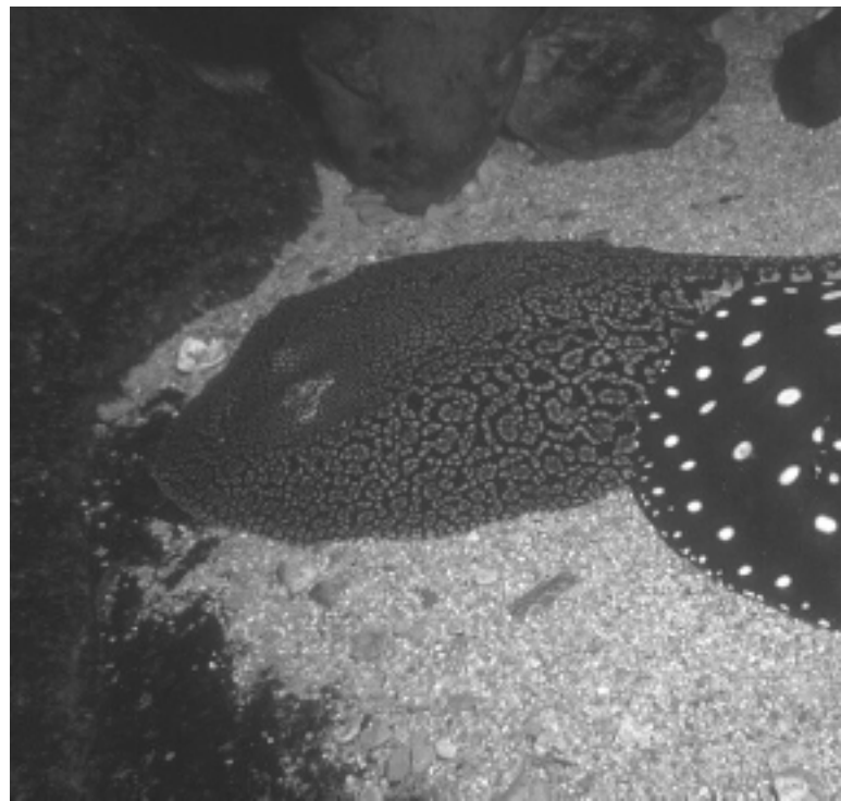
Freshwater stingrays maintained at the Aquarium of the Americas.